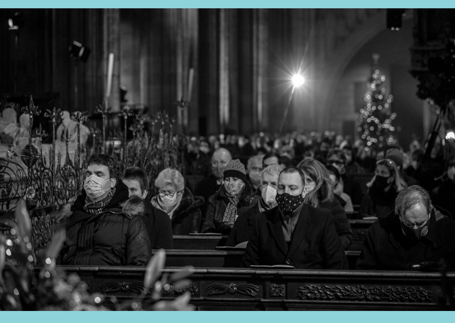
Prague, Cathedral of Saints Vitus, Wenceslas and Adalbert: Christmas Eve Midnight Mass, 24<sup>th</sup> December 2020.